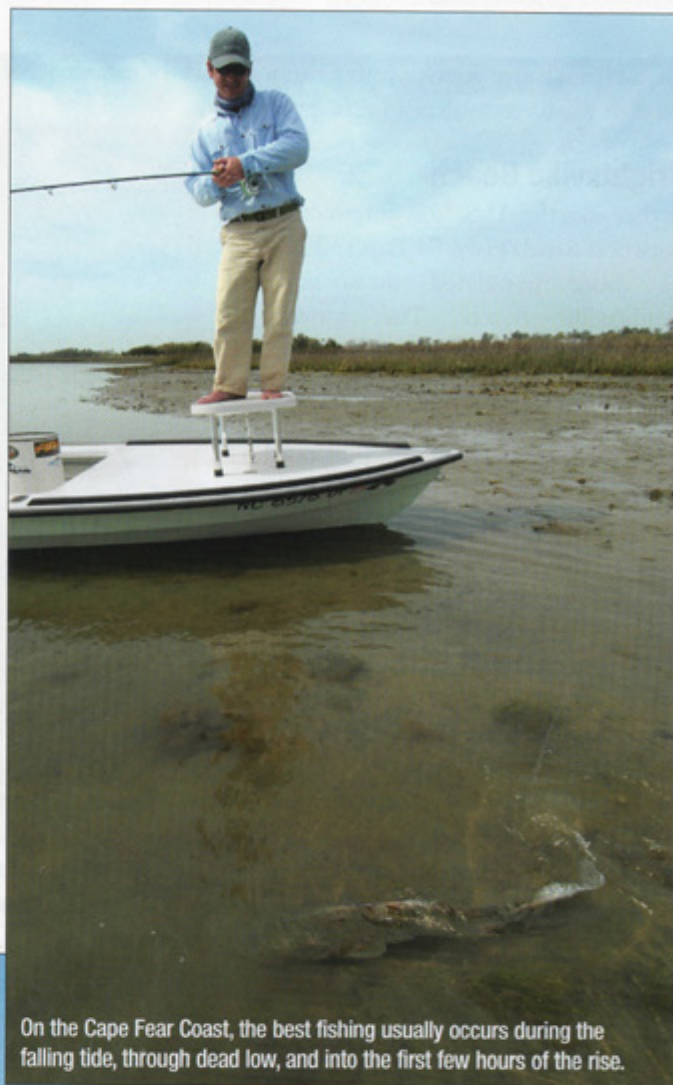
On the Cape Fear Coast, the best fishing usually occurs during the falling tide, through dead low, and into the first few hours of the rise.

Be patient if you venture into these wild waters, as this area is remote and predominately shallow sand bottom. Travel slowly at